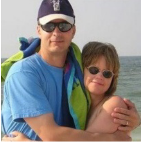
From the treasurer

I still have my 1992 GL1500 and intend to sell it soon, but I knew it had an oil leak somewhere. Nothing major, just enough to always leave a spot on the cardboard I had learned to put under the engine. I thought that it may have been the shifter seal, as when I replaced that recently, I found that the one that was there was not seated properly at all — it only stayed on the bike because it couldn't get off the shifter by itself. But that repair did not solve the problem. So now that I have a 1800 to ride and it's a bad time to try to sell, I decided to see if I could find the leak.